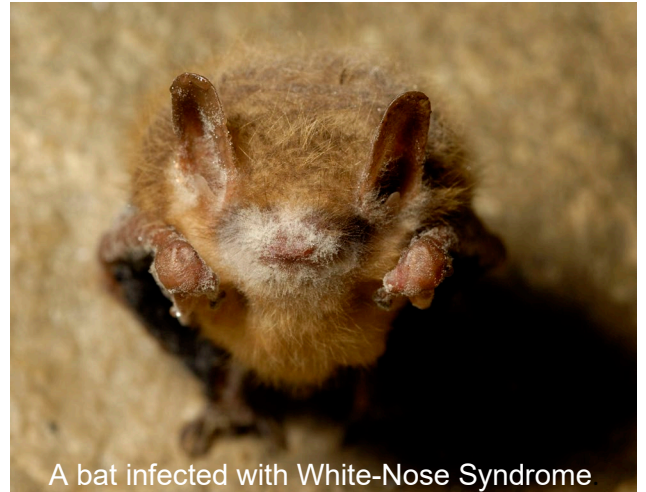
A bat infected with White-Nose Syndrome

The disease is killing bats as they hibernate in caves and mines. Named for a cold-loving, white fungus typically found on the faces and wings of infected bats, WNS causes bats to awaken more often during hibernation. As a result, they use up their stored fat reserves which are needed to get them through the winter when insects are not available. Affected bats often emerge too soon from hibernation and are seen flying around in winter. These bats usually freeze or starve to death. Scientists identified a previously unknown species of cold-loving fungus, Pseudogymnoascus destructans , as the cause of the skin infection. Pseudogymnoascus destructans thrives in low temperatures (40–55° F) and high humidity – conditions commonly found in caves and mines where bats hibernate.