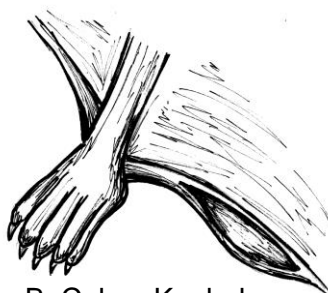
B. Calcar Keeled