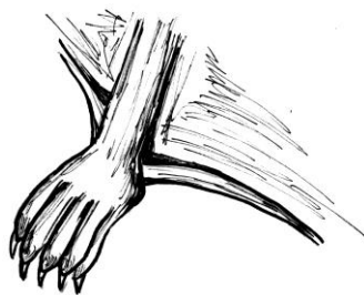
A. Calcar Not Keeled

Keeled Calcar – a well-defined spur made of cartilage that extends from the ankle towards the tail.